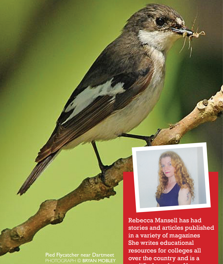
Pied Flycatcher near Dartmeet