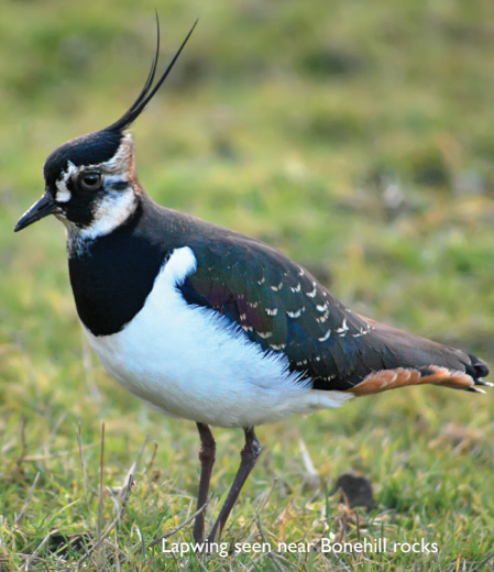
Lapwing seen near Bonehill rocks