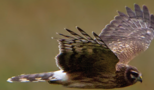
Hen Harrier hunting near the Warren House Inn in winter